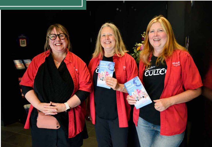
Cultch Volunteers