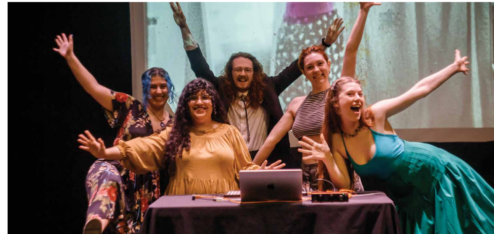
YOUTH PANEL