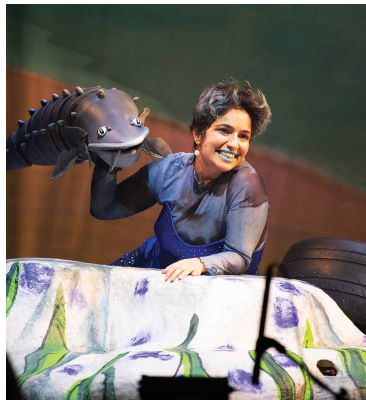
EAST VAN PANTO: LITTLE MERMAID Ghazal Azarbad