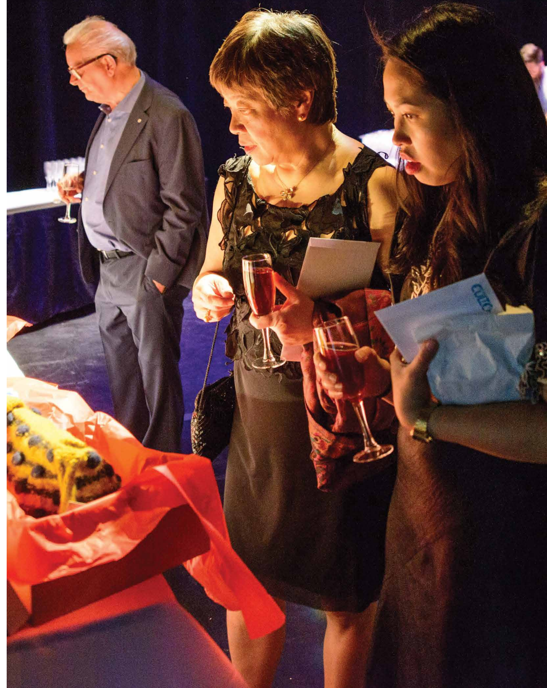
Gala attendees