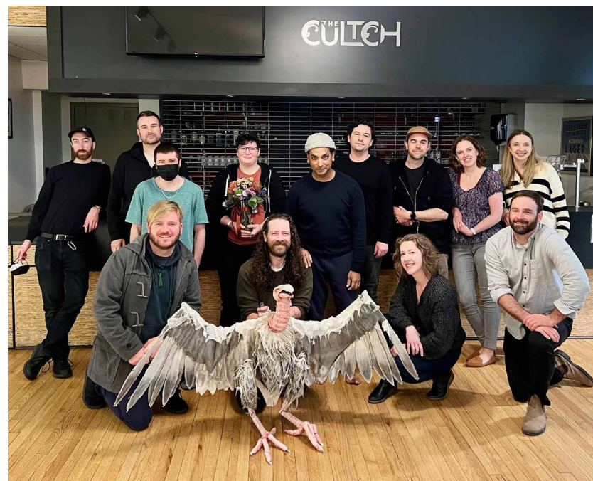
CULTCH STAFF WITH PARADISE OR THE IMPERMANENCE OF ICE CREAM TEAM

Our 2022/23 Season contracted approximately 130 Staff, which included latse Local 118 Technicians, Box Office attendants, Bartenders and Front of House.