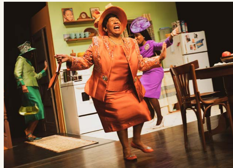
HOW BLACK MOTHERS SAY I LOVE YOU Image by Kenny Ho