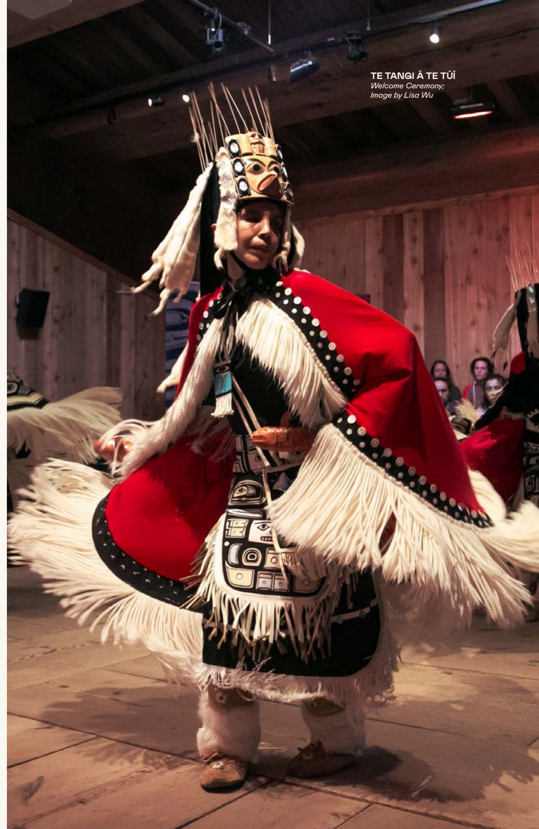
TE TANGI Ā TE TŪI Welcome Ceremony