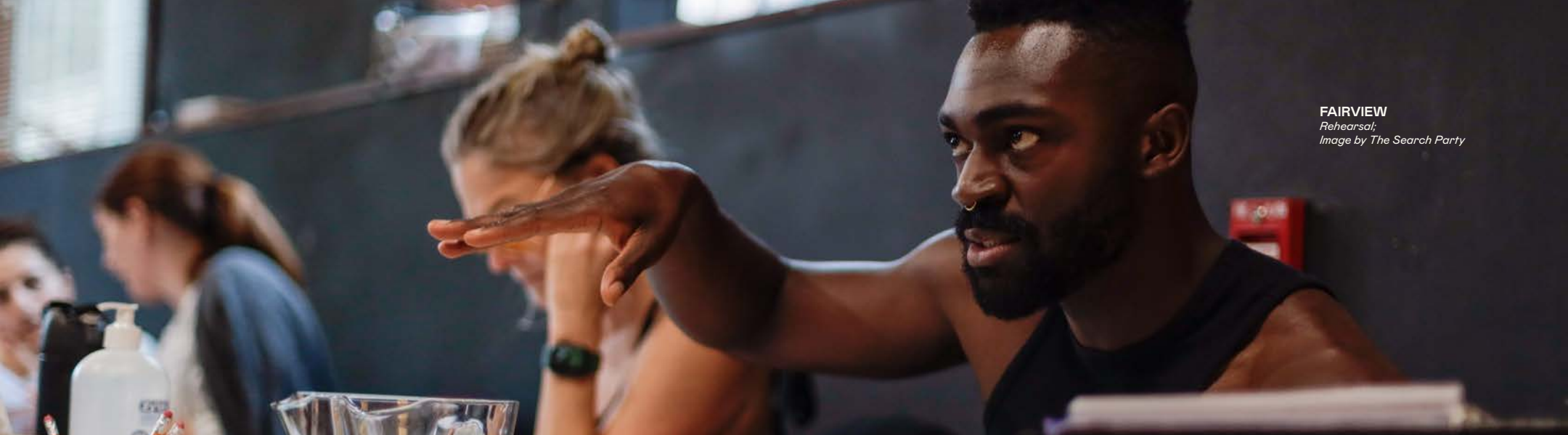
FAIRVIEW Rehearsal