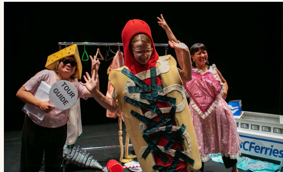
THE CULTCH'S 50TH ANNIVERSARY OPEN HOUSE

As a non-profit arts organization, The Cultch relies on the generosity of its donors to continue to operate. Revenue from ticket sales represents one third of our annual budget. We are endlessly grateful to our donors for their generosity and vision.