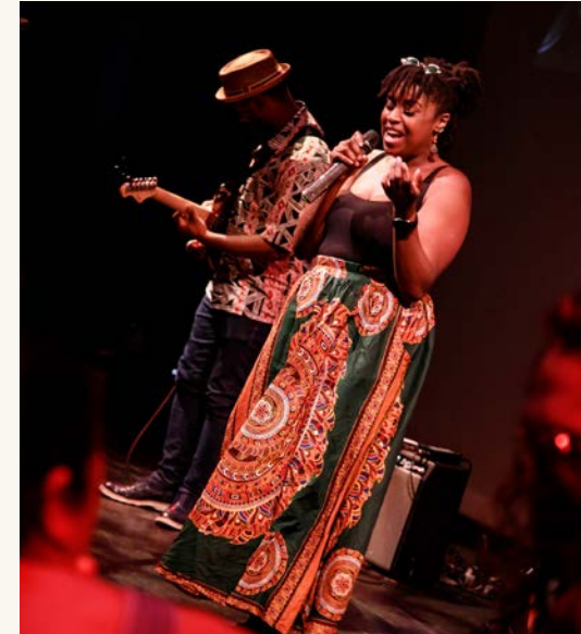
2024 IGNITE! FESTIVAL