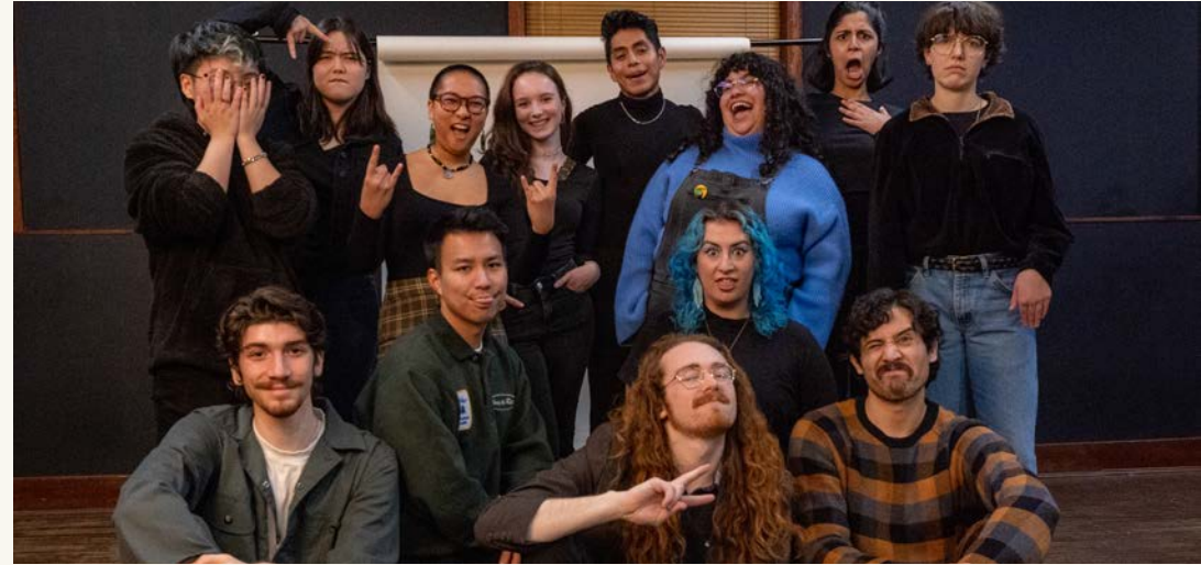
THE CULTCH'S YOUTH PANEL