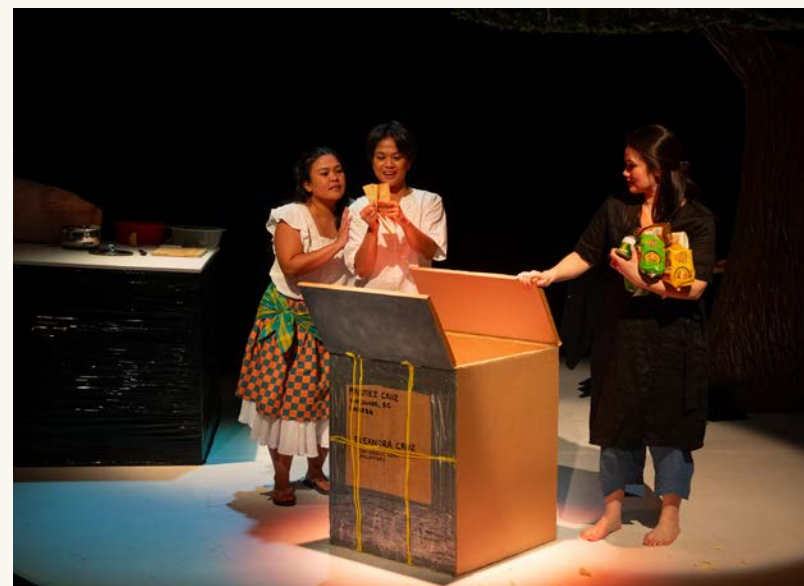
HOME COMING Image by Mark Halliday

PuSh International Performing Arts Festival (Vancouver)— The Shadow Whose Prey the Hunter Becomes