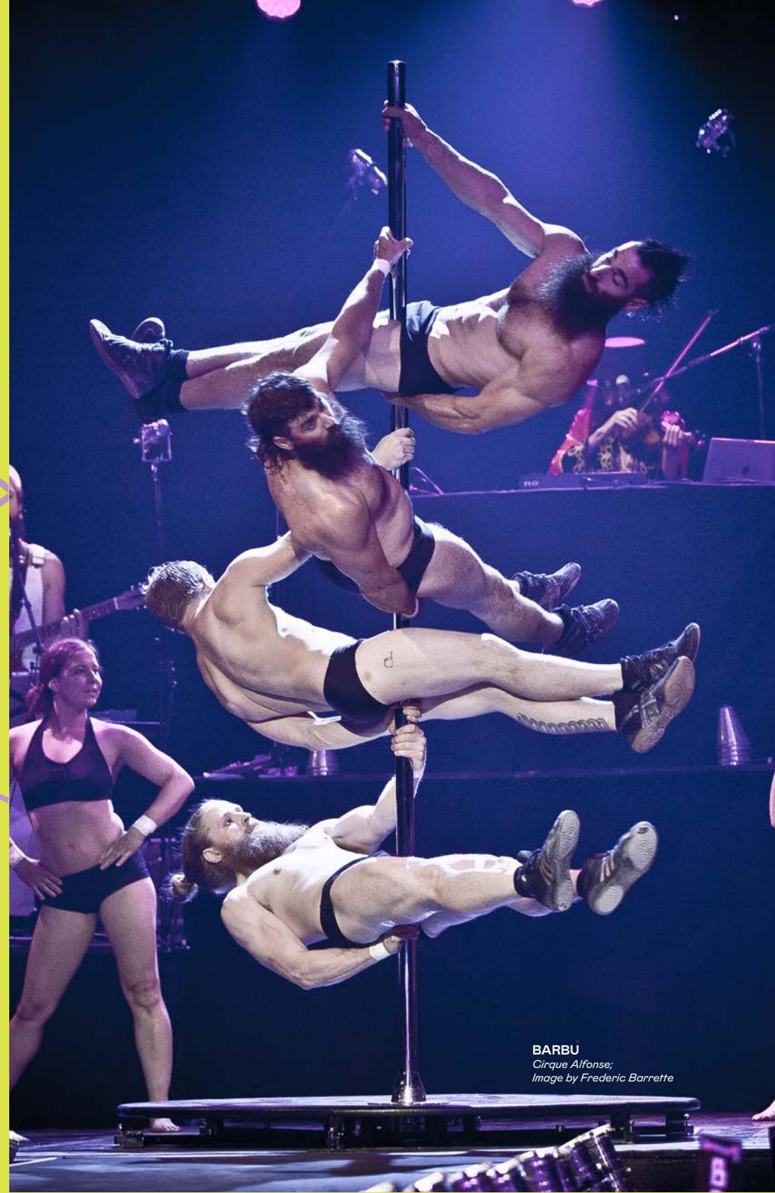
BARBU Cirque Alfonse

This Impact Report is our account of the work The Cultch has accomplished together, and is a record of our standing commitments to those we are responsible to serve and uplift.