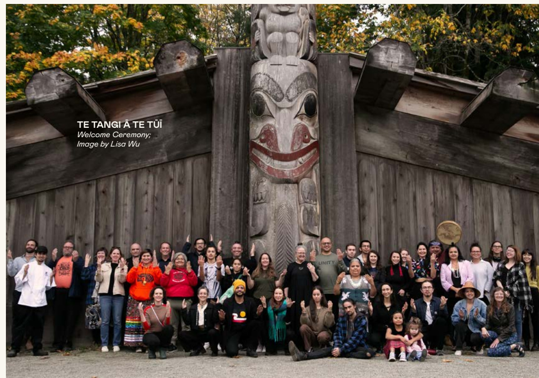
TE TANGI A TE TŪI Welcome Ceremony; Image by Lisa Wu

Urban Ink's film adaptation of their cutting-edge, award-winning musical theatre production (which premiered at the York in 2018) had six sold-out screenings at The Cultch following its appearances at 15 film festivals all over North America.